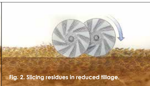
Fig. 2. Slicing residues in reduced tillage.