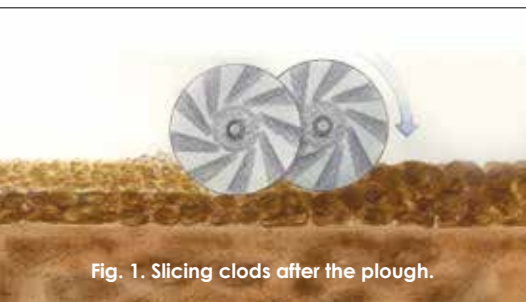
Fig. 1. Slicing clods after the plough.