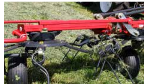
Square boom frame for intensive use and closed drive line