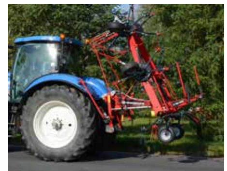
Z 765 PRO