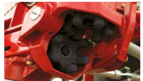
Finger Link transfers the power between the rotor units