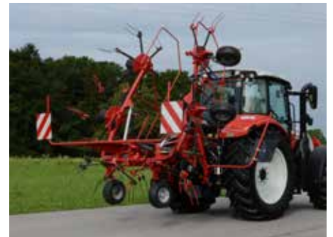
Z 665 HYDRO