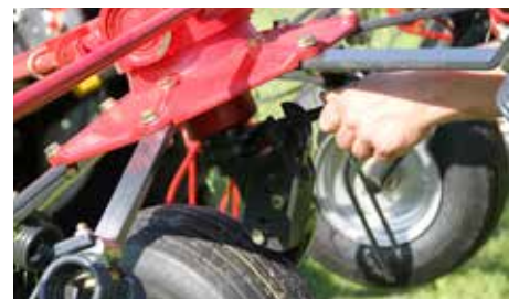
Field boundary clearing