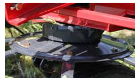
Closed gear box, ensures minimum maintenance requirement