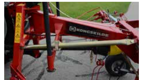
Stabilizer ensures smooth operation