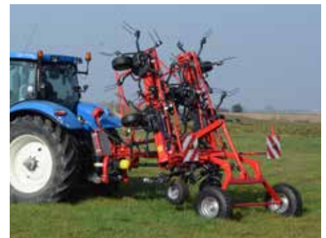
Z 8805 T