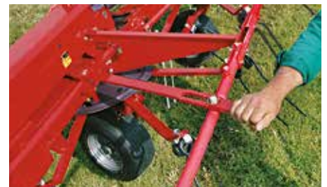
Field boundary clearing with Pro-series