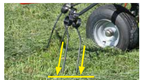
Asymmetric double tines