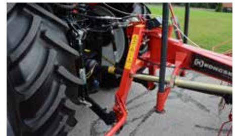
Articulated headstock ensures perfect ground following