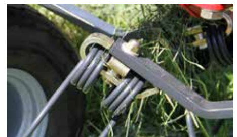
Tine safety lock