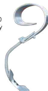
VF 2000 / 4200 / 4300 / 4000 VFM tine with 11 cm heavy duty reversible share.