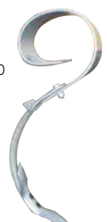
VF 2000 / 4200 / 4300 / 4000 VF tine with 6.5 cm heavy duty reversible share.