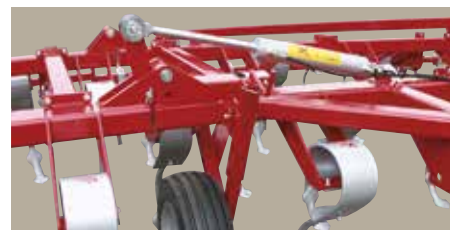
VF 4200 / 4300 / 4000 Folding with double acting cylinders.

Both models are available as a pull type. The drawbar is fitted in the place of the standard 3-point hitch. However, a special wheel arrangement is fitted for road transport and depth control.