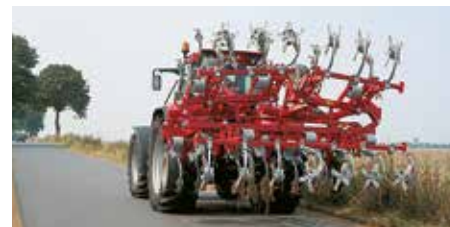
VF 4200 / 4300 / 4000 Flat folding side extensions.