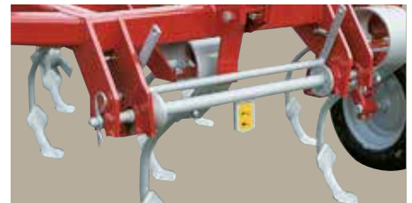
VF 2000 / 4200 / 4300 / 4000 Quick release drawbar.

Standard features on front mounted version include large castor-type wheels to ease steering of the tractor, and a special bracket incorporated in the top link to protect both tractor front lift and cultivator against overloading.