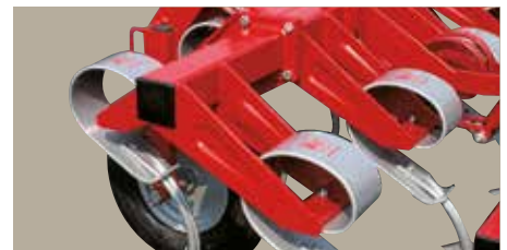
VF 2000 Bolted on side extensions.