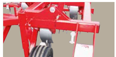
VF 4200 / 4300 / 4000 Rubber wheel 6.00 x 12" with spindle adjustment.