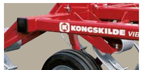
VF 2000 / 4200 / 4300 / 4000 Heavy duty box section frame.