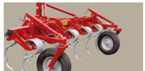
VF 2011 Front mounting enables implements to be used in combination.