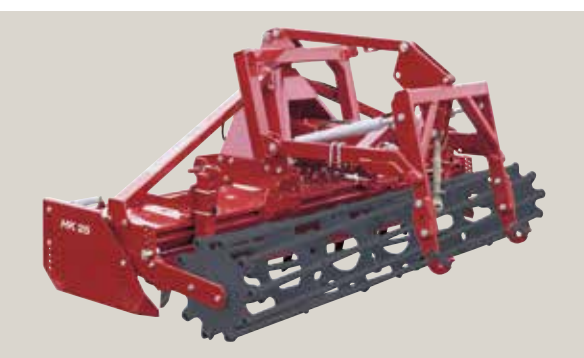
HK 25 with crumble roller and hydraulic Hitch (optional).

The HK 25 Power Harrow is a Power Harrow for medium size farms to work behind tractors up to 95 kW(130 HP). A machine which has been built in some thousand units has been further developed to meet the wishes of today farmers and to work together optimal with modern tractors and seed drills.