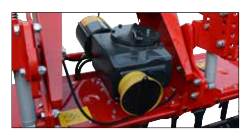
3-speed leverchange gearbox with rear PTO.

Different rollers, front and rear levelling bars, different Hitches and many other options are available for the Howard HK 31.