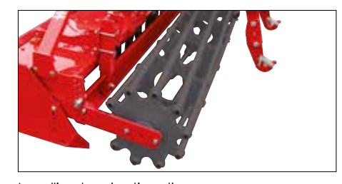
Levelling bar (optional).