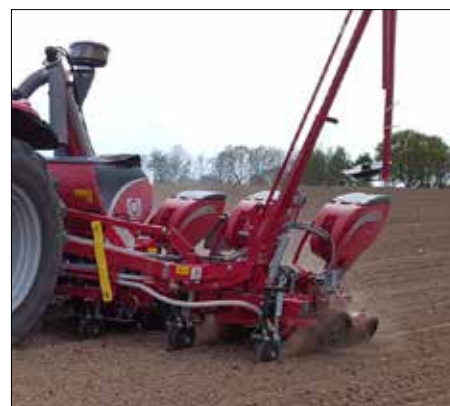
Uncompromising and modern.