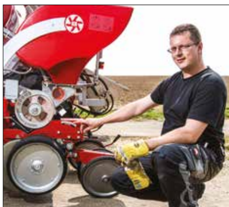
Easy to use.