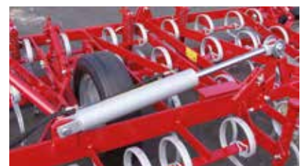
Folding and unfolding with double-acting cylinders.