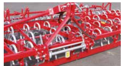
Semi-quick hitch for easy coupling.