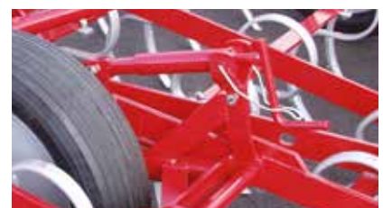
Spindle adjustment with scale.