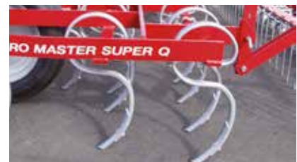
SQ-tine with reversible ultra share.

Both the SGC and the Super Q models can be delivered in pulled-type versions.