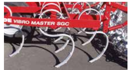
S-tine with reversible ultra share.

All connection points for options have already been welded on to the frame to abandon difficulties when mounting them.