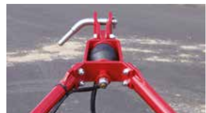
Rubber buffer for protection of machine and tractor.