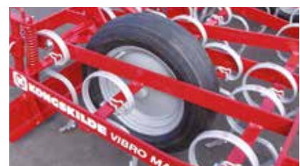
Wheel 165 x 15" standard for SQ. Wheel 6.00 x 12" standard for SGC.