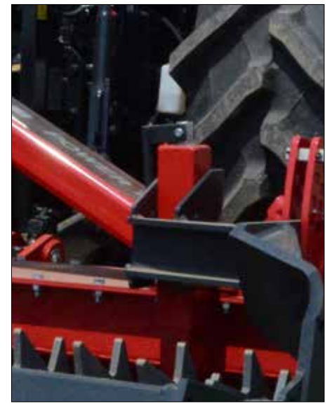
Height adjustment by spindle and suspended on rubber bumper.