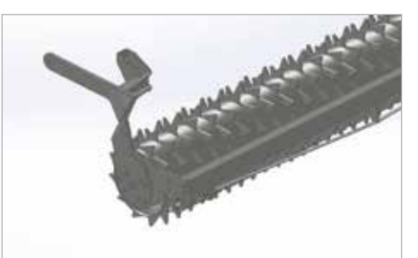
Tooth packer roller.