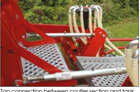
Top connection between coulter section and tank with adjustable top link, allowing level adjustment of coulter module,