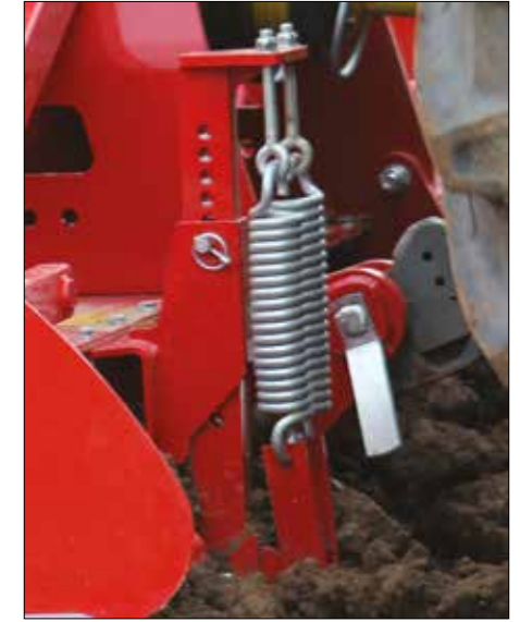
Track eradicator with double spring.