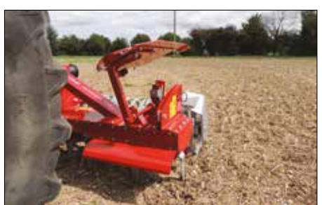
Side deflector in road transport position.