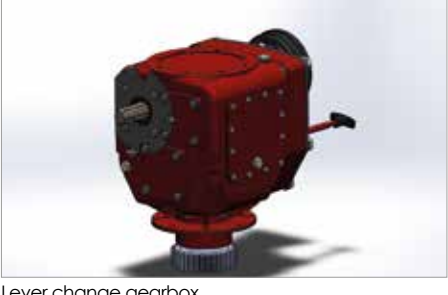
Lever change gearbox.