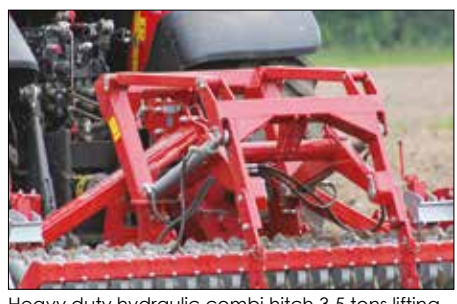
Heavy duty hydraulic combi hitch 3.5 tons lifting capaity.