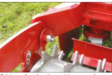
Quick coupling of coulter module on rear roller