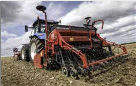
Heavy duty hydraulic combi hitch with MASTERLINE seed drill.