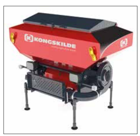
Kongskilde NS1500/1900 front tank gives a really good balance for the whole combination.