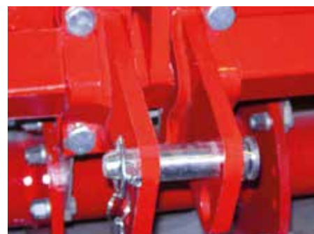
Special removable Cat. 1 lower linkage attachments. These also allow attachment to tractors with Cat 2 linkage.