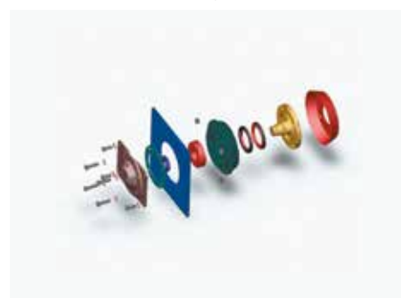
Rotor bearing unit fitted with end-face mechanical seals.