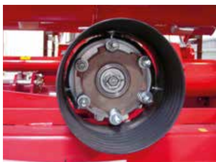
Genuine Howard clutch with brass friction plates for additional safety.