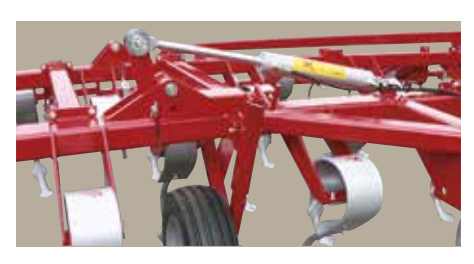
VF 4200 / 4300 / 4000 Folding with double acting cylinders.

Both models are available as a pull type. The drawbar is fitted in the place of the standard 3-point hitch. However, a special wheel arangement is fitted for road transport and depth control.