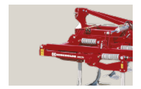
Advanced frame design.