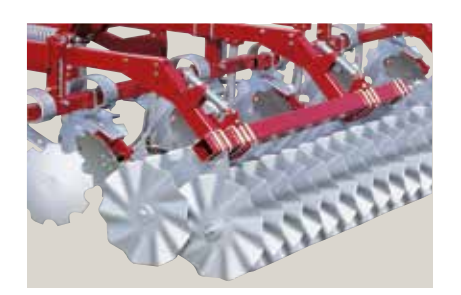
Tandem Cutter Roller.