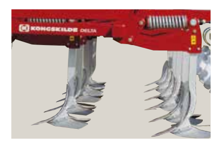
Automatic Reset Stone Protection.

This prevents trash blockages and allows the Delta to operate at extremely high forward speeds providing an enviable output. The Delta models are available with optional rear wheels for semimounting to the tractor.