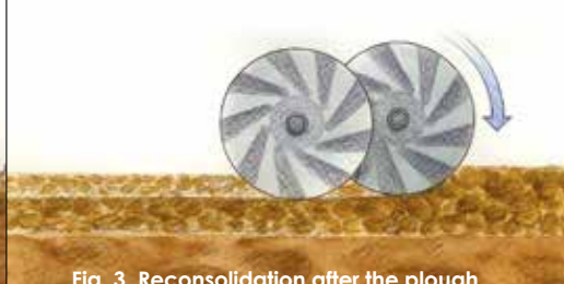
Fig. 3. Reconsolidation after the plough.