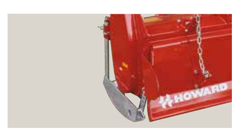
Depth control skids.

The machine is available with 3 different depth control systems: Side skids, front skids and front wheels.