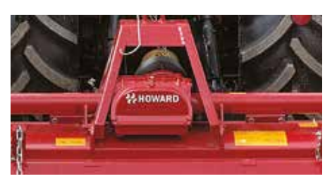
Selectatilth four speed gearbox.