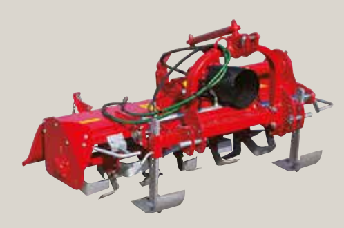
Rotavator 400 B (Basic) Rotavator 400 S (Super) Rotavator 400 Z (off set option)